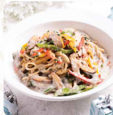
Spaghetti with Truffle & Mushroom $39.80