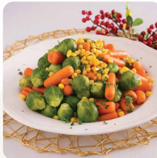
Roasted Garden Vegetables $33.80