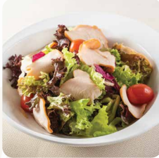
Chicken Ham Salad $39.80