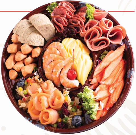
Festive Cold Cut & Seafood Platter $78.80

Chicken Honey Ham, Cheesy Cocktail Sausages, Smoked Salmon Pasta Salad, Chestnut Meat Loaf, Beef Salami, Mango Prawn Salad, & Kani Crab Legs