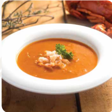
Lobster Bisque $18.80