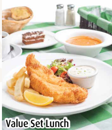
Value Set Lunch