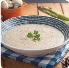
Truffle Mushroom Soup $18.80