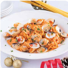
Spaghetti with Clams in Creamy Tomato Sauce $42.80