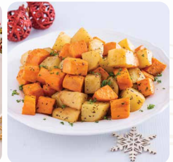
Roasted Potato Medley $33.80