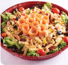
Smoked Salmon Pasta Salad $39.80